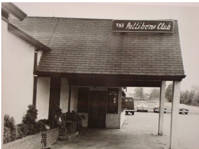
Pettibone Club Entrance