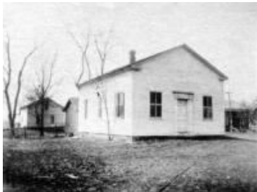
Town Hall—Circa 1914 Now—Burns Lindow Bldg