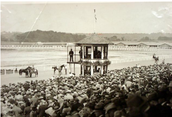
Starting Tower at Race Track