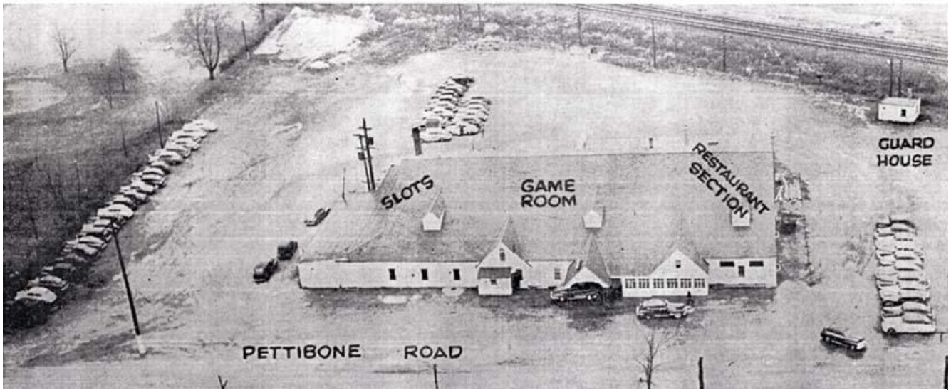
Aerial View of the Pettibone Club 1947