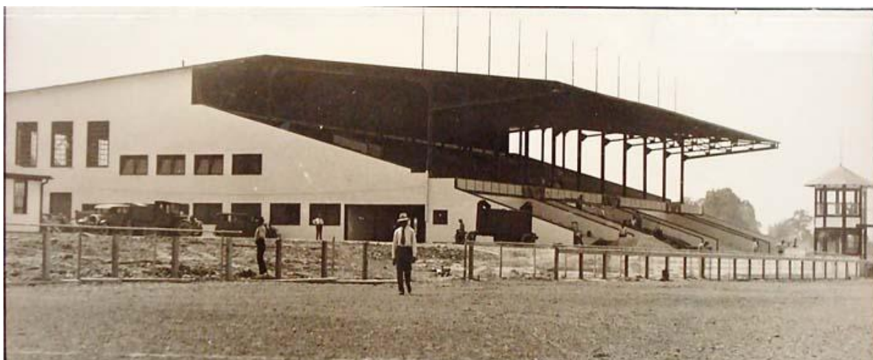
Bainbridge Race Track