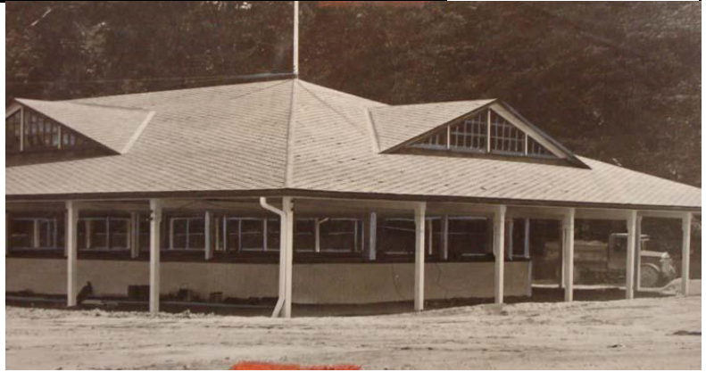
Paddock At The Race Track

take legal action if he received a complaint but none had been made nor did he know the location of any slot machines. The article went on to describe several places including a gas station on Rtes. 306 and 87 in Russell, the Middlefield Tavern and Tall Timbers restaurant on old Rte. 422 at the Bainbridge/Auburn line. One of the best known gambling spots was the Pettibone Club, located just inside the Geauga county line near Aurora and Pettibone Roads. It became quite a large-scale operation that was open every night as well as Wednesday and Sunday afternoons. It began operations in the 1930s as the Arrow Club and continued for many years until it was temporarily closed by Ohio Governor Frank Lausche. It quickly resumed operations under the Pettibone Club name when additions were made to the building. It was reported that 100 slot machines were lined up for use together with card and dice games, liquor and food. Deliveries of meat and produce were made for the club's restaurant by Jaros/Sargent's Bainbridge store (now part of Century Village), and they were happy to get this business. The Club operated into the 1950s. Another gambling spot in the township on Chillicothe Road referred to as the