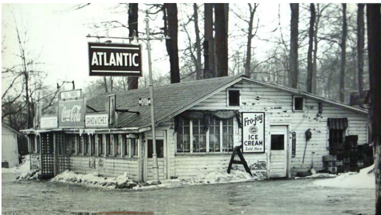
Tall Timbers, another place with Slot Machines

Story by Harriet Novy.