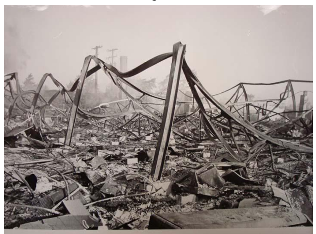
Burnt Ruins of Pettibone Club - 1963