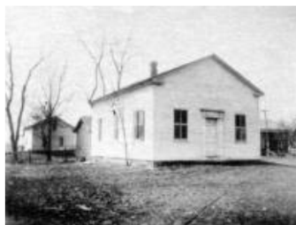
Town Hall—Circa 1914 Now—Burns Lindow Bldg

Bainbridge Township Historical Society P.O.Box 23363 Bainbridge Township